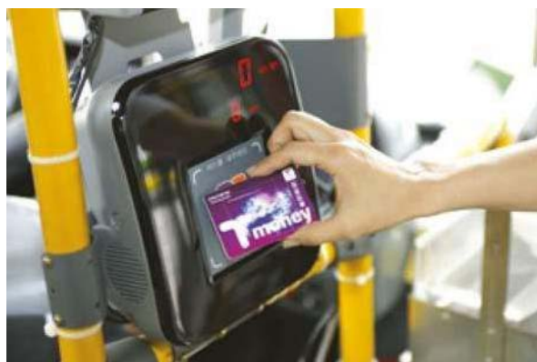
Figure 7. Electronic fare box for T-Money at Seoul BRT vehicles.

4.2.5. Network width and transit network integration. As of 2008, Seoul BRT systems are about 74km long spanning eight corridors. They connect with eight Seoul Metropolitan Area rail transit services as well as regional and national rail services. The systems are connected to some major bus and train interchanges. At interchange facilities, passengers transfer between BRT services and other transport services by walking along standard sidewalks, semi-sheltered walkways and sometimes crossing roads through signalised pedestrian crossings. Transferring information is provided through maps and signs. Seoul Metropolitan Government [17] imposes an integrated fare system for all public transport services within Seoul Metropolitan Area. Under the fare system, a passenger is charged based on the total distance travelled by taking the consecutive services. The system is applied through the use of contactless smart card for payment that is recognised on all BRT vehicles as well as on other conventional buses and inner city trains.