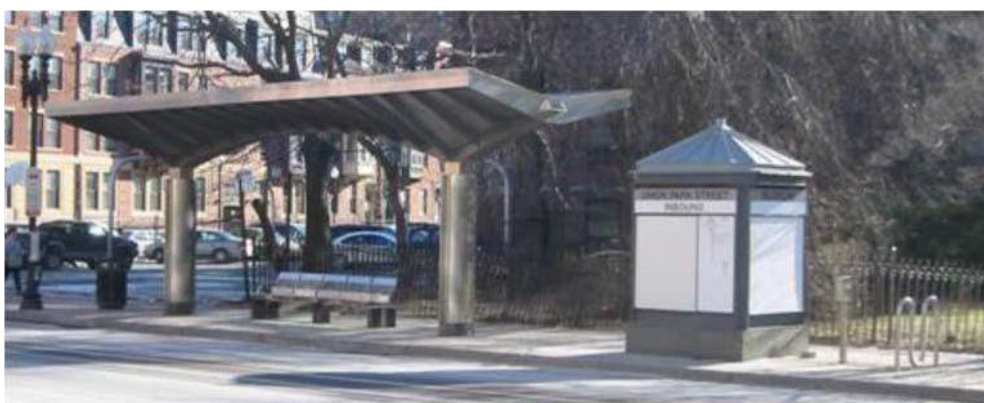
Figure 1. Boston SL4/5 typical station.

4.1.1. Station configuration and accessibility. Schimek et al. [16] noted that Boston SL4/5 have 14 stations and distanced on average at 320 m. Stations are located on the curb side and adjacent to sidewalks. Stations are utilising standard curb at 15cm high, leaving 20 cm height gap between curb and bus door floor. Stations are equipped with station name and direction, a route map, a transit network map and a neighbourhood map. Some stations are equipped with transferring information. Stations also have bike racks. Figure 1 shows the typical appearance of Boston SL4/5 stations.