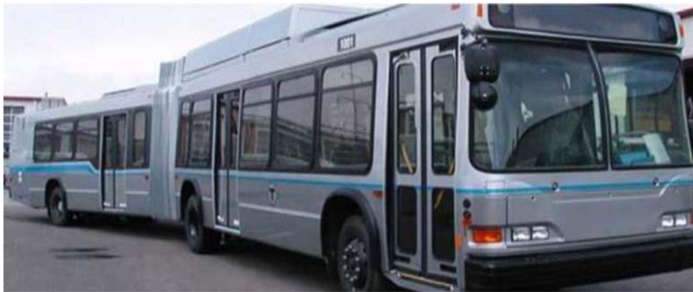
Figure 2. Boston SL4/5 articulated bus.

4.1.3. Segregated right of way. 2.7km out of 3.86km of SL4/5 route length is curbside bus lanes. The curbside bus lanes are painted continuously in red and given 'bus lane' mark. SL4/5 utilise bus-priority traffic signals at some traffic intersections that give priority to SL4/5 buses that are late according to the schedule [16].