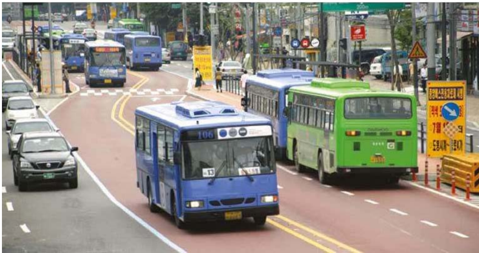
Figure 5. A Seoul BRT station with overtaking lanes. [17]