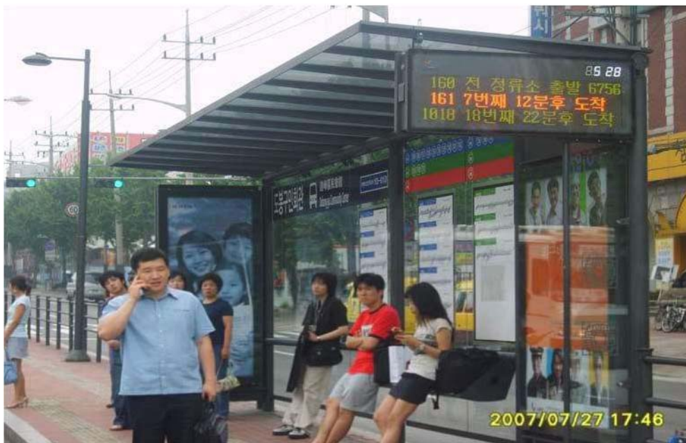
Figure 6. Seoul BRT typical median lane stop.

4.2.2. Vehicle capacity and accessibility. Seoul Metropolitan Government (SMG) [17] mentioned that Seoul BRT systems utilise various types of buses for various types of services, that are 8 to 15m long single buses and 18m long articulated buses. Some buses introduced after 2004 are low-floor buses with 20cm height gap between buses door floor and curb, have two to three 1.2m-wide doors and have wheelchair-loading facilities.